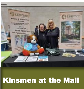
Kinsmen at the Mall