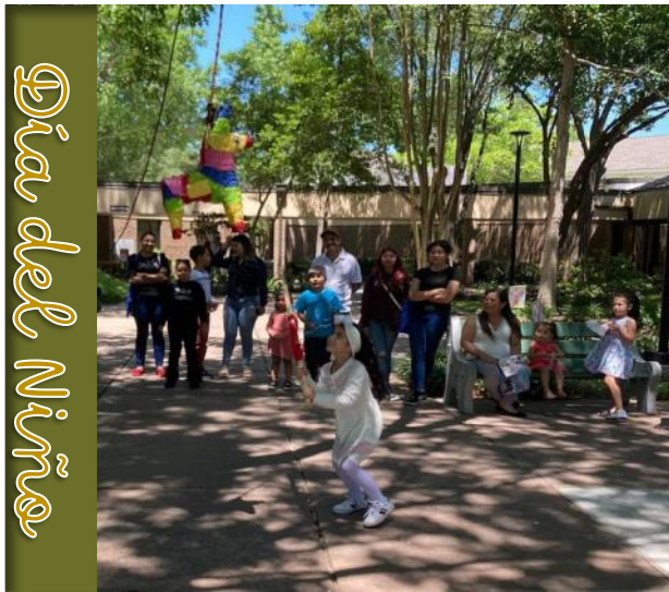
Día del Niño