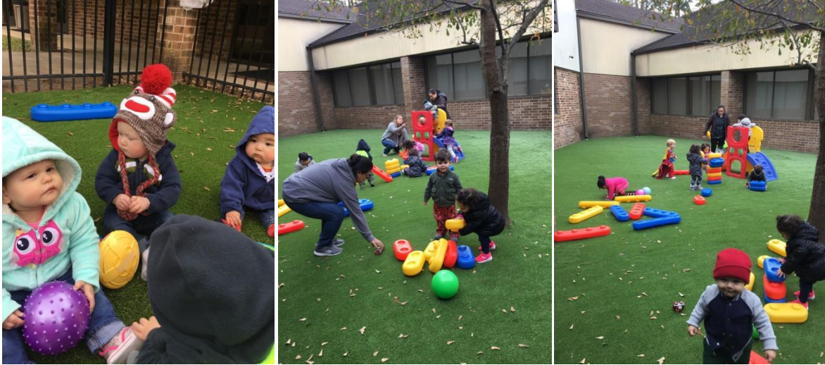
November 2018: $4,000 completes a turf project to ensure KCA kids can enjoy God's creation as soon as the weather clears.